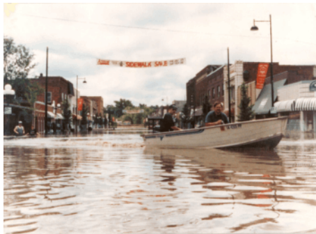
5th st - Valley Junction