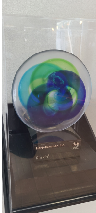
Ruskin Rep of the Year