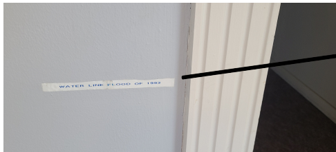
Flood line inside the office