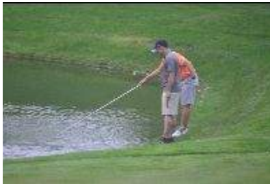
Pictured: ASHRAE golfers demonstrating how not to golf.