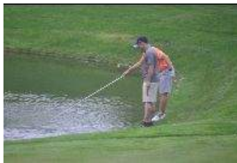
Pictured: ASHRAE golfers demonstrating how not to golf.