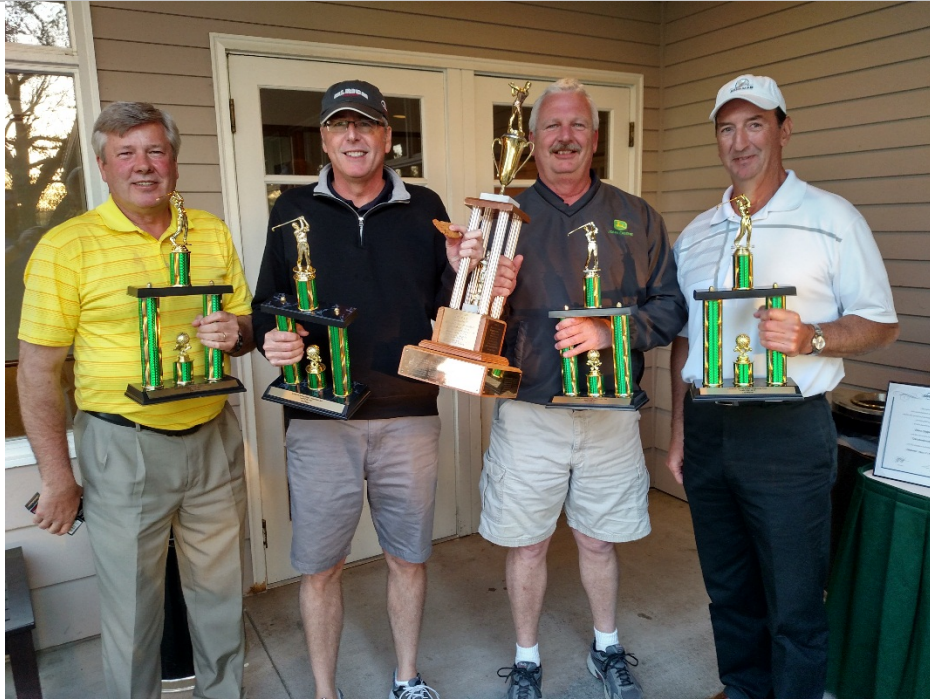
The Winners of the 2015 ASHRAE Spring Fling!